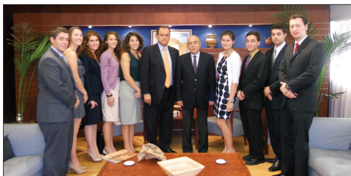
Student delegation with Honorable Yiannakis Omirou, President of the Cyprus House of Representatives.

The American Hellenic Institute Foundation (AHIF) Foreign Policy Trip to Greece and Cyprus completed its fourth year as nine students from across the United States participated in the two-week program held June 13-29, 2012.