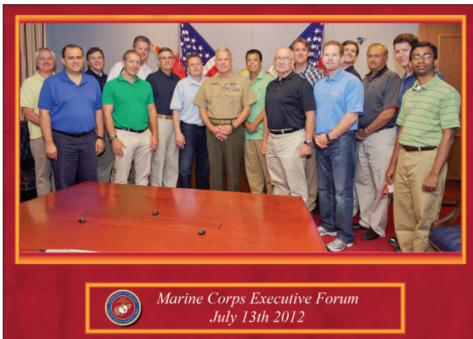
The attendees with the Marine Corps Commandant, General James F. Amos.