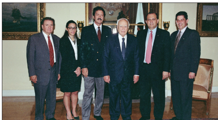
AHI delegation with President of Greece Dr. Karolos Papoulias.

A delegation from the American Hellenic Institute (AHI) successfully completed the organization’s annual leadership trip to Greece and Cyprus where it held substantive meetings with high-ranking government and religious officials and business