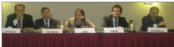
View of the Panel during the Q & A session.

AHI hosted the policy seminar “The Greek Economic Crisis: Myth & Reality” featuring a panel of experts who examined various aspects of the topic on April 25, 2012 at the Capital