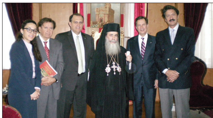
AHI delegation with Patriarch Theophilos III of Jerusalem at the Greek Patriarchate in Jerusalem.

From May 21 to 23, AHI visited Israel to conduct meetings with Israeli government officials, including members of the Knesset (Israeli Parliament), and business leaders in addition to Greek government officials. Topics of discussion centered on the evolving relationship between Israel and Greece and Cyprus as well as U.S.-Israel relations.