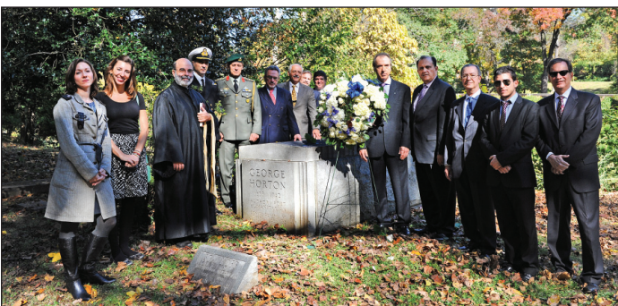
The ceremony attendees at George Horton's gravesite.

AHI hosted a memorial to commemorate the 90th anniversary of the Smyrna catastrophe in Asia Minor at the gravesite of U.S. Consul General George Horton, whose book The Blight of Asia provided a firsthand account about the destruction of Smyrna and the plight of the Greeks of Smyrna. The memorial was held October 22, 2012, at Oak Hill Cemetery, Washington, DC. The ceremony, which included a wreath-laying, a prayer, and brief remarks about Consul General Horton in appreciation of his telling account, received coverage in The Washington Times .