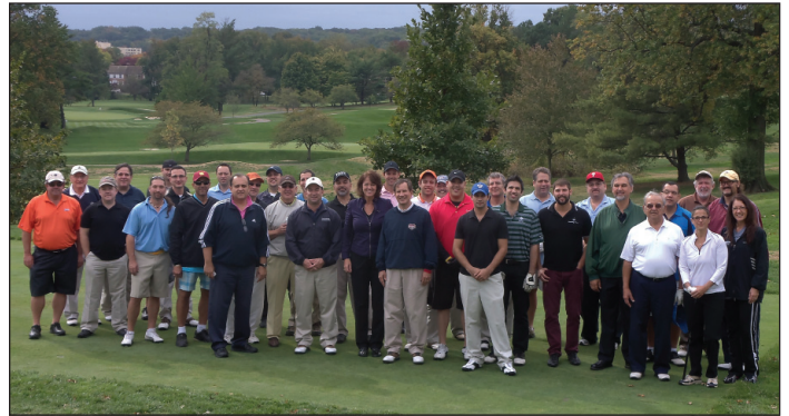
All of the AHI Golf Tournament Participants.