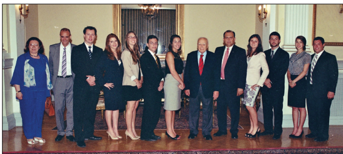
Meeting with President of Greece, Karolos Papoulias.

the U.S., and the interests of the U.S. in the region. There were meetings or briefings with American embassies, officials from various ministries, including Foreign Affairs; parliament members, religious leaders, think-tank organizations, and members of academia and the private sector of both countries. In Cyprus, the group visited the Turkish-occupied area.