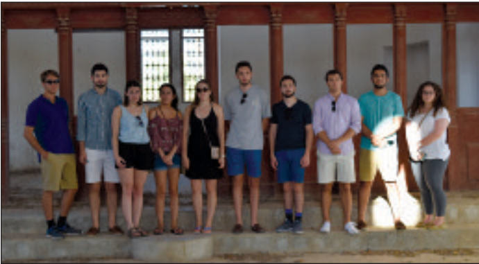
A desecrated Orthodox Church in the Turkish occupied area.