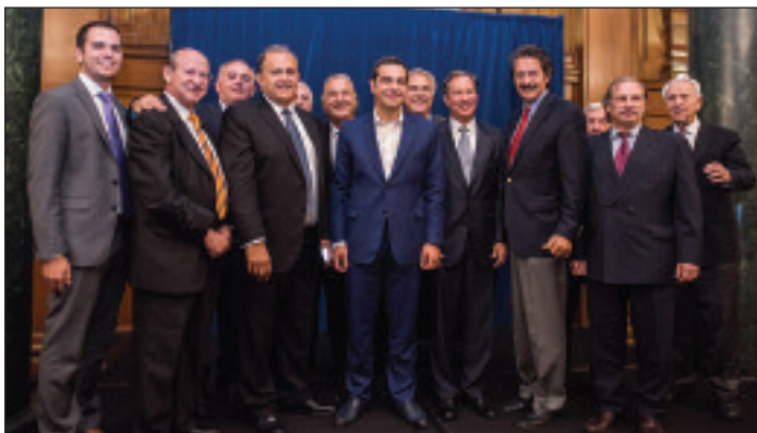
AHI members share a moment with Prime Minister Tsipras.

Prime Minister Tsipras described members of the community as the best ambassadors, and added, “You represent the values of freedom and democracy.”