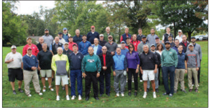
14th Annual AHI Golf Classic participants.