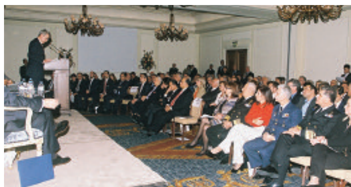
View of attendees.