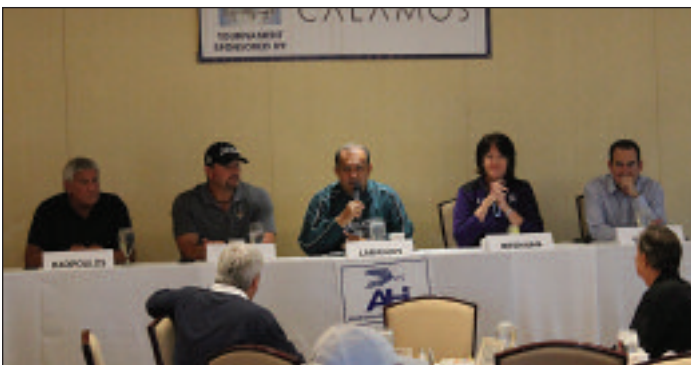
Sports panel discusses important topics in today’s news.

AHI hosted its Fourteenth Annual Golf Classic at Belle Haven Country Club, Alexandria, Va., Oct. 16, 2017. Fifty-four golfers participat-