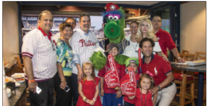
The Phillie Phanatic visits the VIP Suite to entertain the fans.