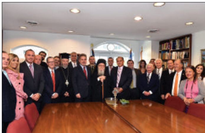
The guests in attendance at the AHI Foundation E. John & Cleo Rumpakis Library ceremony.