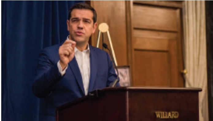
Prime Minister Tsipras delivers remarks.

Continental, Washington, D.C. Prime Minister Tsipras was in the midst of a five-day visit to the United States, which included a meeting and joint press conference with President Donald J. Trump, Oct. 17.