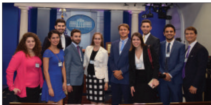
White House Press Briefing Room.