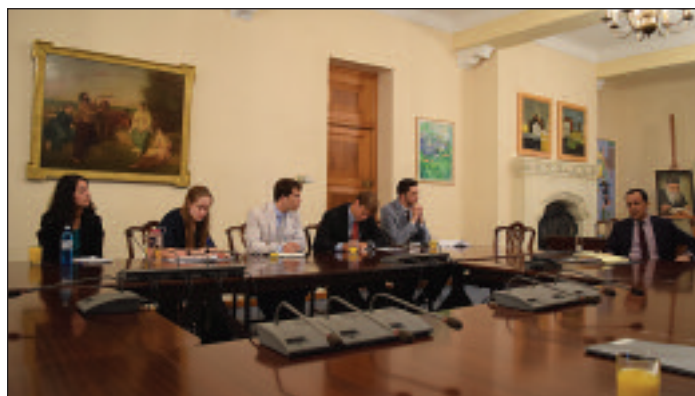
Nicos Christodoulides, Cypriot Government Spokesman briefs students at the Presidential Palace.