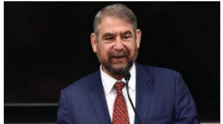
Cypriot Ambassador Leonidas Pantelides.