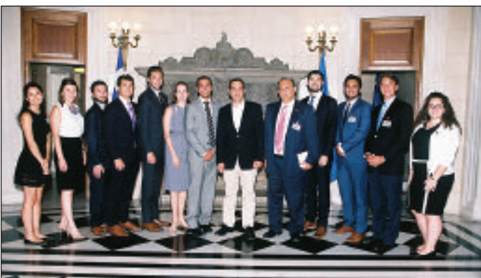
Prime Minister Alexis Tsipras with the students at the Megaro Maximou.